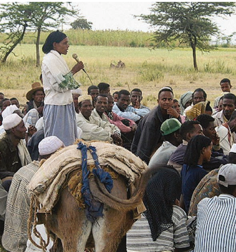
An Ethiopian woman speaks out against female genital mutilation, opening the floodgates of change.