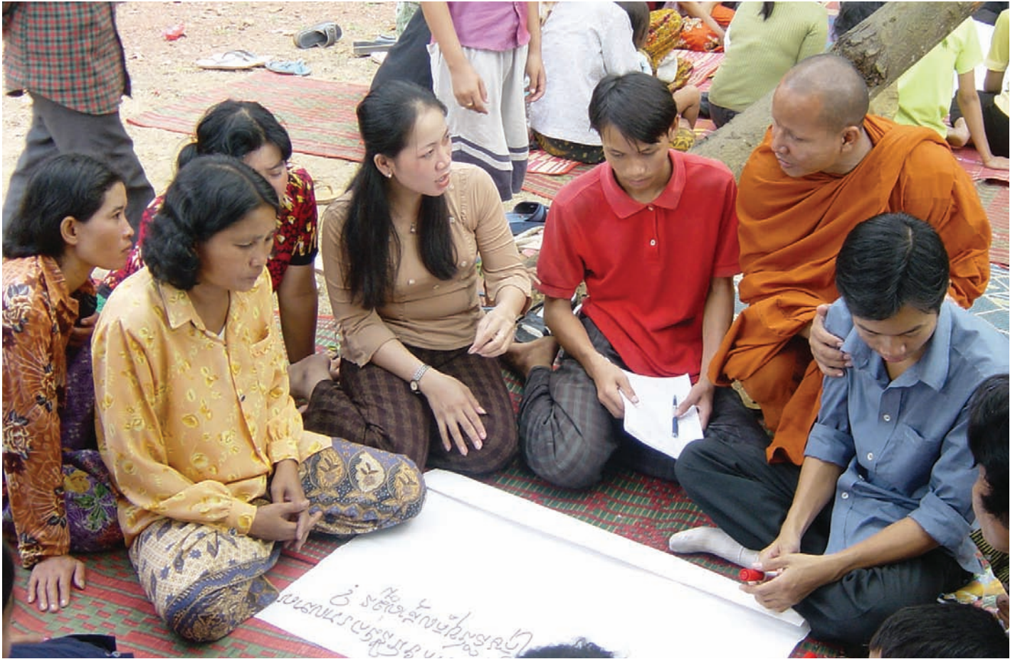
Government representatives and Cambodian monks work with local groups to seek effective responses to the AIDS crisis.