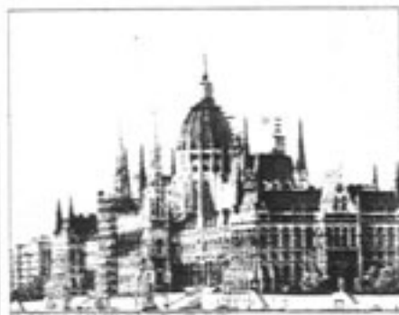
Eastern approaches — page 87