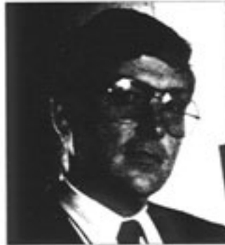
Burgess — page 38